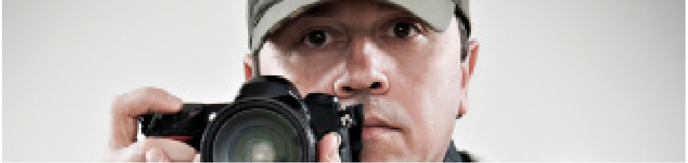
Photo Contest Categories – Open to newspaper & digital news members