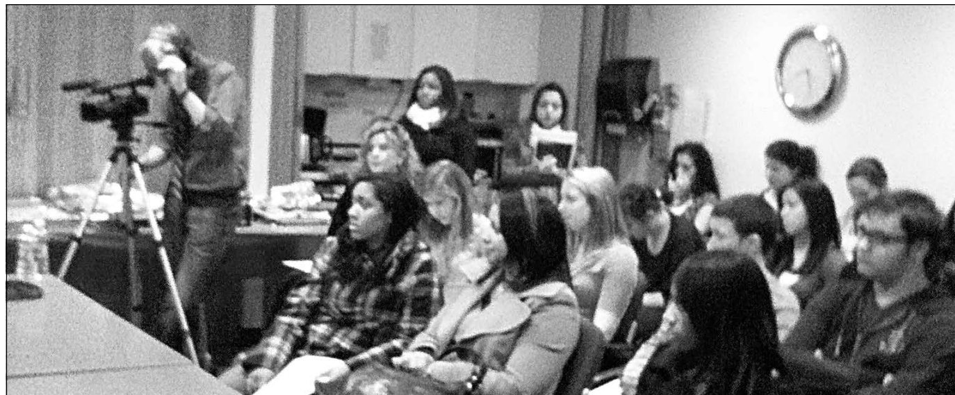
MULTIMEDIA JOURNALISM: Students in the Project 9/11 program are experiencing modern journalism. Not only are they reporting their experiences in their school papers, they are filming guest instructors and creating a multimedia website that will include their interviews of children, now in their teens and early twenties, who lost family members in the Sept. 11 attacks.