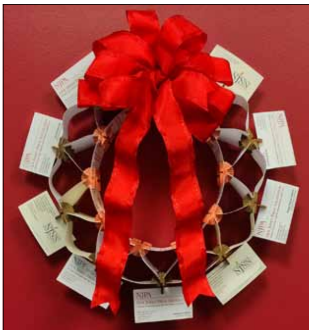
BUSINESS CARD WREATH greets visitors to NJPA's office this holiday season, with cards from each staffer.